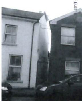
Right-hand side elevation, facing south