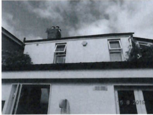
Rear elevation, facing east. Also containing single storey extension.