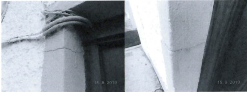
Slight cracking to reveals of front main entrance door.