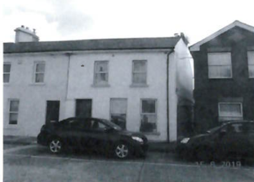
Front elevation, facing west