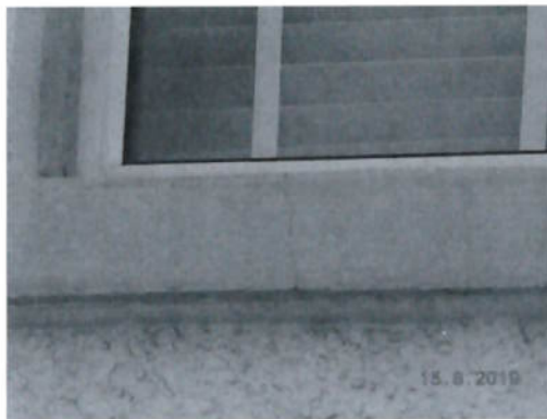
Very fine cracking through the first floor level window cills as viewed from the front elevation.